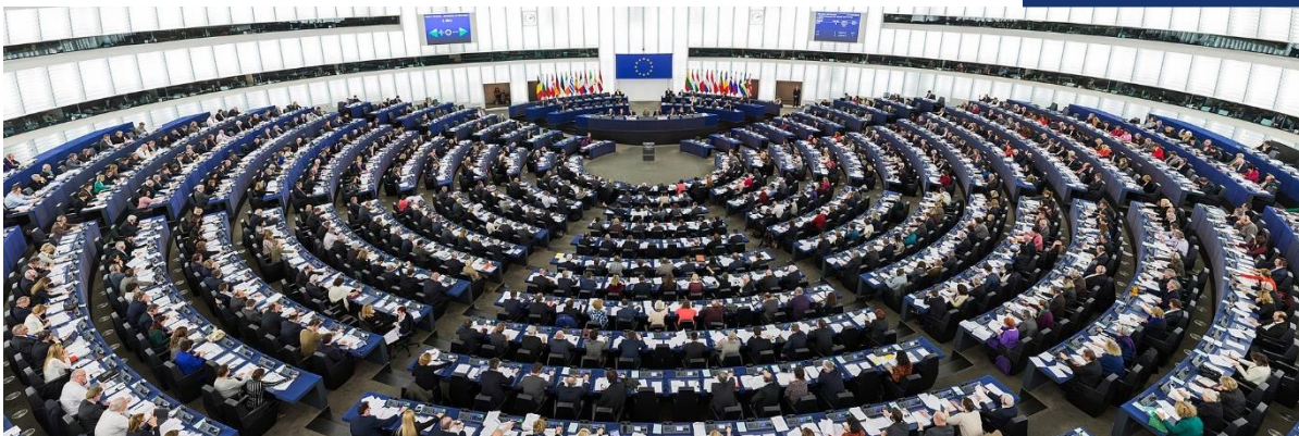
POLICY BRIEFING (10/2019)